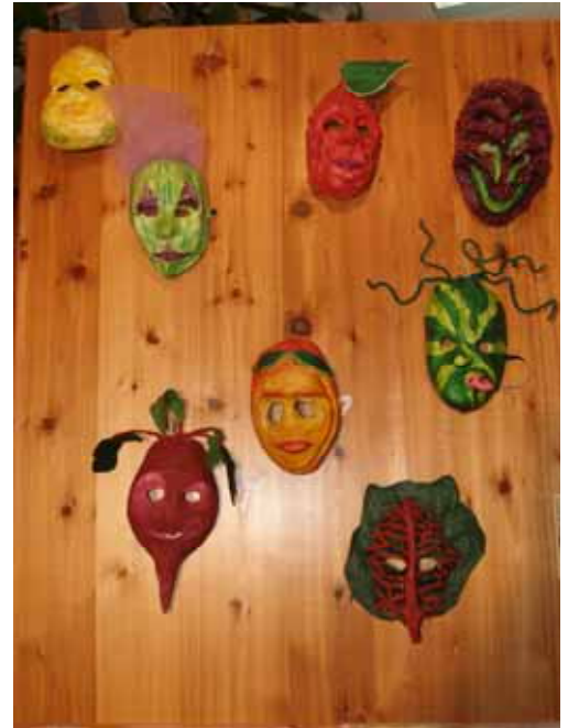
Some of the masks from A Lot On Your Plate